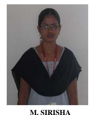
First: 82.2% M.E- 27<sup>th</sup> Rank