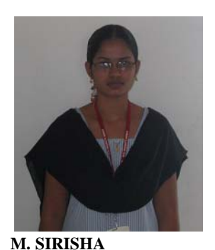
Third: 82.2% M.E- 35<sup>th</sup> Rank